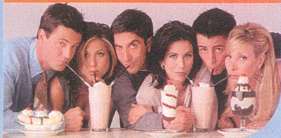
The cast of Friends .

Jennifer's attitude toward honest discussions—on topics that many stars would never touch—is totally refreshing. So far, Jen's tackled taboo stuff like Hollywood's pressure to be thin ("It's infuriating!" Jen says), to dealing with problems like your parents' divorce (Aniston's parents split when she was 10. "I was definitely angry about it."). Jen will also host chats with other celebs, and allow girls who visit the site to shoot questions her way anytime. "I want girls to realize that what they have to say is important and valuable," she says. "[Girls] should have a place to express themselves without fear of feeling stupid or being judged. Voxy is an amazing forum for that." Amen to that.